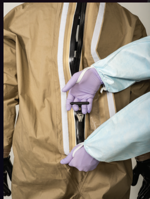
Easy to hold rear zipper aids donning and doffing ergonomics.