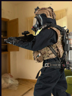
Tactical style garment for law enforcement and military use.