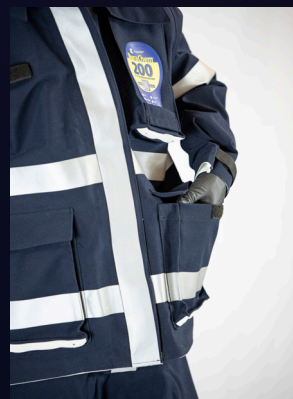
Pockets and equipment loops are popular customizations.