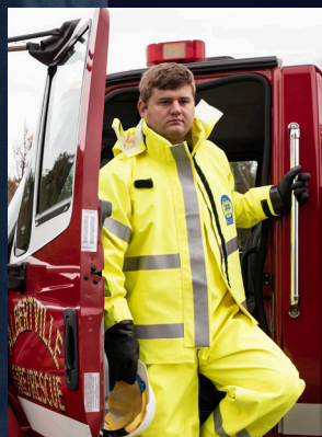
Firefighters can reduce use of expensive turnout gear.