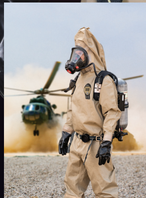
Tan color option is often preferred for Military use.