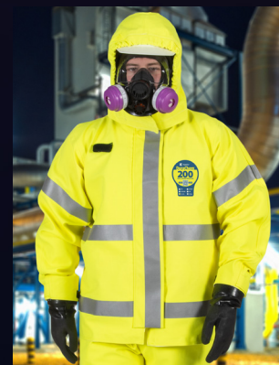
DuraChem 200 is also ideal for industrial work.

DuraChem 200 does not contain PFOA or PFOS Chemistry.