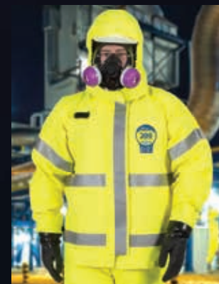
DuraChem 200 is also ideal for industrial work.

Complete technical and chemical test data for the DuraChem