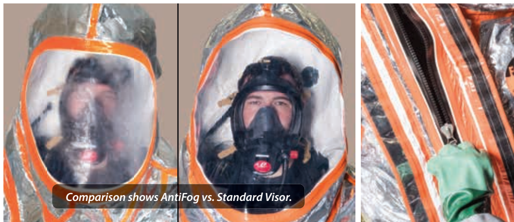
Comparison shows AntiFog vs. Standard Visor.