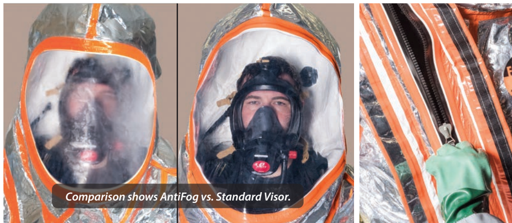
Comparison shows AntiFog vs. Standard Visor.